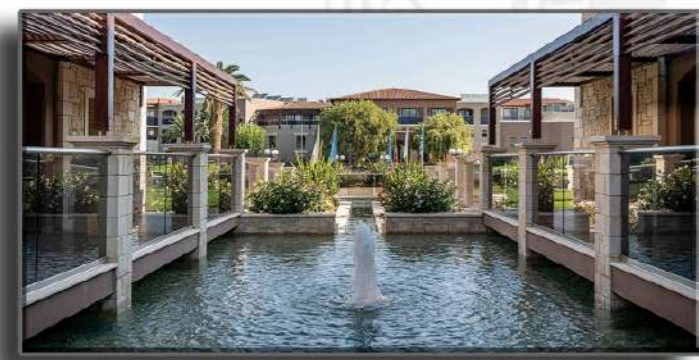
CALDERA CRETA PARADISE - CHANIA REGION

41st Panhellenic Congress 23 - 27 April 2025 Chania - Crete